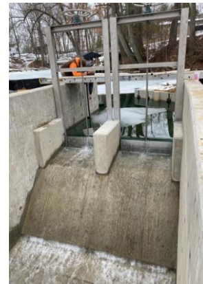
New dam gates