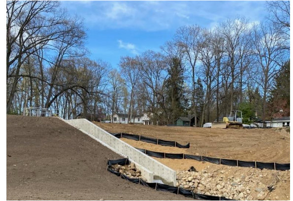
The new concrete spillway

The Gull Lake Dam Legacy wall, currently under construction, will display engraved bricks for those who contributed $1000 or greater to the dam construction project. There are about 300 bricks in the wall. The wall will be approximately 21 feet wide and 4 feet tall. It will be affixed to the top of the sheet pile on the east side of the dam. The engraved side of the bricks will face toward the creek, so they can be seen by boat. We will announce by e-mail and via the Gulllakedam.org website once the wall is completed.