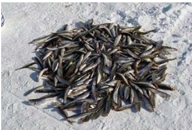
Figure 3. An abundant catch of smelt through the ice

does not negatively influence fish populations, and that fish are able to navigate back to their home ranges after being caught and transported for weigh-ins at launches. Anglers are penalized heavily for fish that don't survive and utilize lakes for repeat events over time, so are heavily invested in maintaining the quality of bass populations in Gull Lake and others that are used for tournaments.