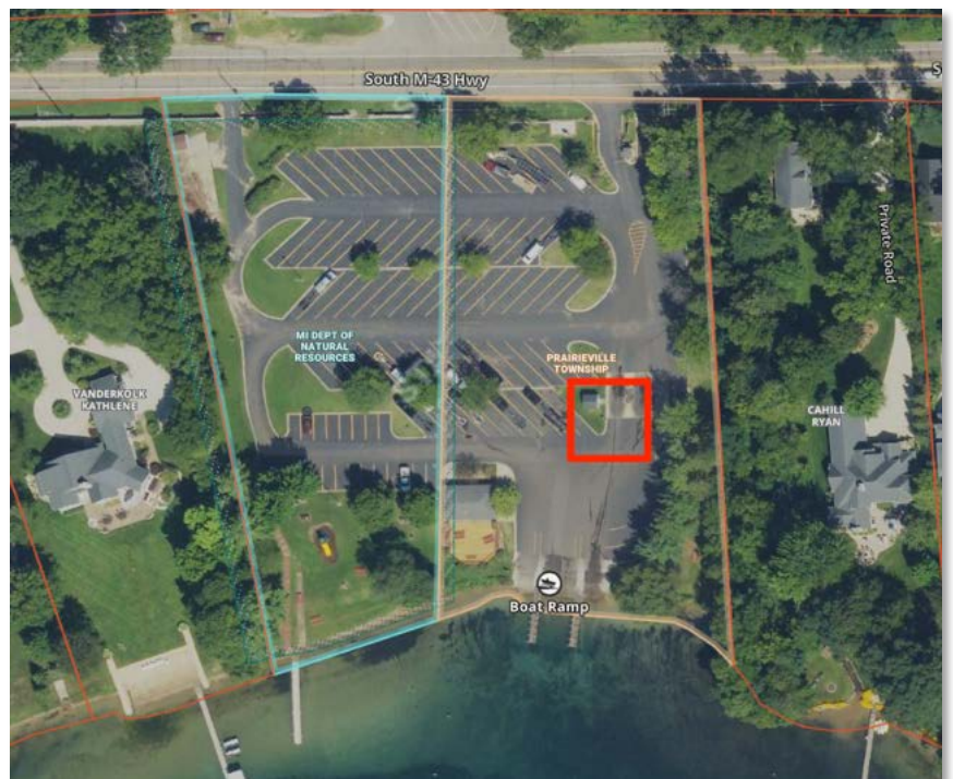
Digital image of the Prairieville Township Park on Gull Lake indicating the property boundaries for the MDNR (blue) and Township (yellow) and red (boatwash station). The GLQO has a signed agreement to manage the boatwash at the park and improve natural features of the Park.

A recent article in The Michigan Riparian provides information on the importance of installing native vegetation around lakes to project water quality. You can access the article at https://mymlsa.org/living-on-michigans-inland-lakes/ Also, if you'd like to learn how you can enhance your own lakeshore, make plans to attend the GLQO Lunch and Learn program at KBS on July 10. More information on this will be forthcoming.