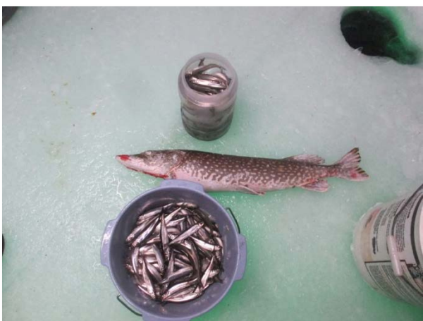
A good catch!

For those of you looking forward to summer fishing, a reminder that the MDNR slot limit on northern pike will go into effect on April 1 st , 2025. Age data from angler caught northern pike in 2018 indicated an abundance of younger (less than 4 years old) northern pike and few older fish, suggesting that larger, older fish were being over-harvested. After an extensive review, the DNR proposed a protective slot limit between 24 and 34 inches for northern pike that was approved by the Natural Resources Commission last fall. Gull Lake is one of 12 lakes in Michigan with a northern pike protective slot limit. The 2025 Michigan Fishing Regulations book includes this regulation for these lakes: “Waters with 24” – 34” protected slot limit on northern pike and daily possession limit of two (2) northern pike”. So be sure to have your tape measure ready if you plan to harvest a pike.