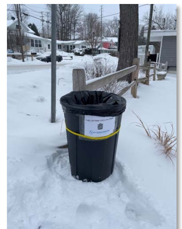
Trash can placed by GLQO at South end of Gull Lake