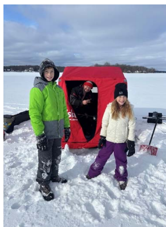
The Corstange family enjoyed a day of ice-fishing on Gull Lake